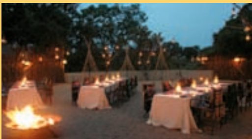
Dining al fresco at Thornybush Game Lodge