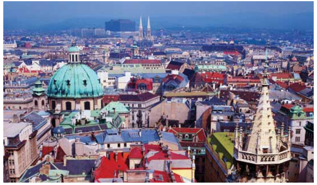
We enjoy both guided touring and free time in Vienna.

Chambers of Wawel Castle, seat of royalty for more than 500 years; and Wawel Cathedral, the national church. The remainder of the day is free to explore this charming city independently. B