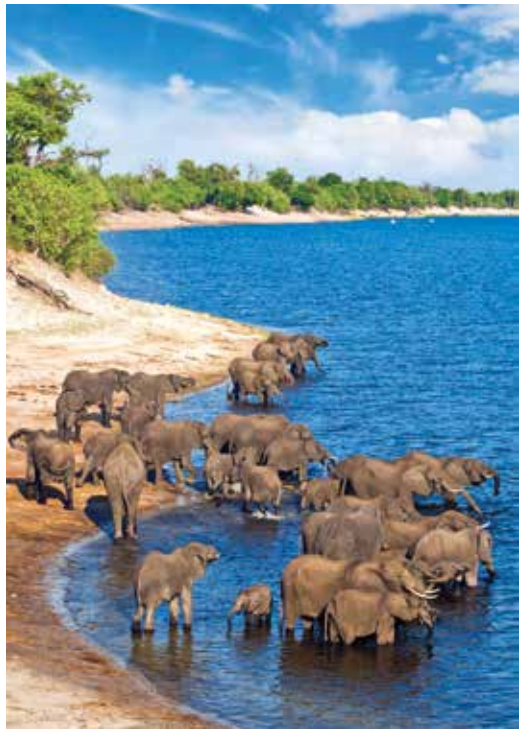
Elephants abound in Chobe.

Saturday, April 8: Depart for U.S. We transfer to the airport this morning for our return flights to the U.S. B