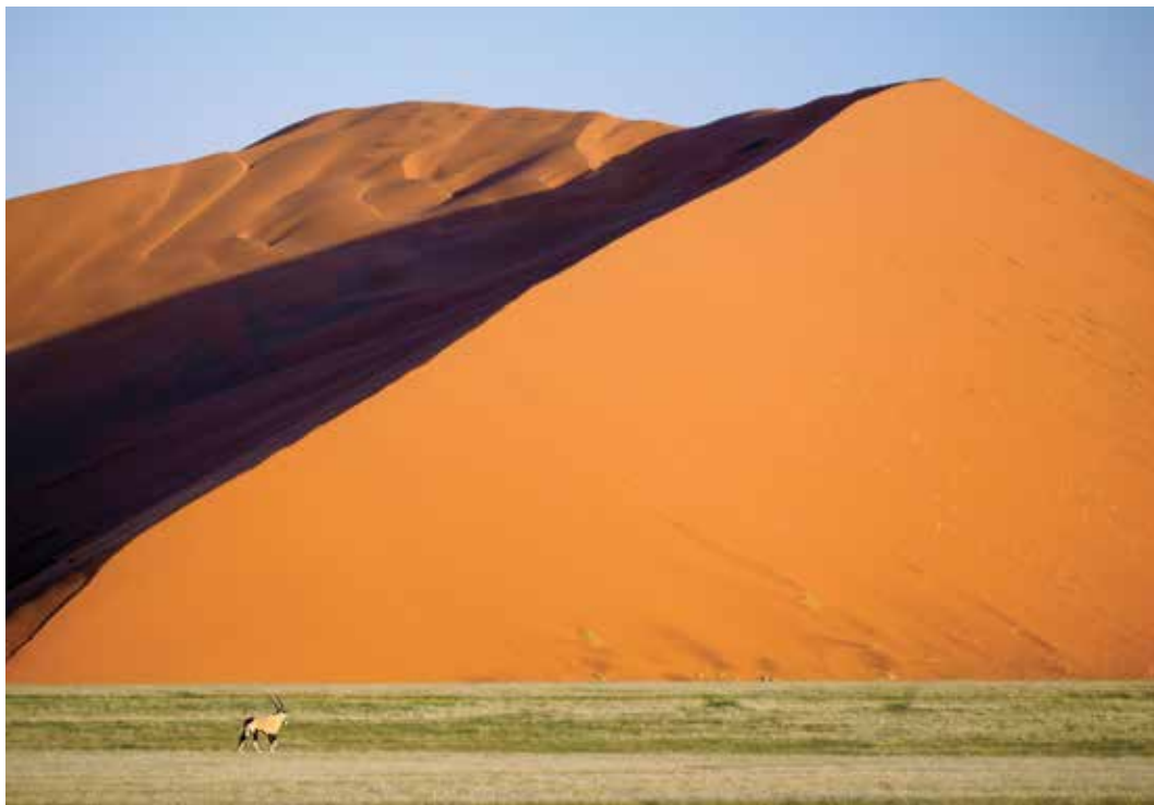
Some of the dunes at Sossusvlei reach as high as 1,300 feet.

Tuesday, March 28: Victoria Falls This morning we set off on a rhino safari in open-top safari vehicles. This afternoon is at leisure; this evening we attend a talk on David Livingstone's travels, trials, and travails. B,D