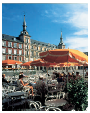
Plaza Mayor in Madrid

the artist El Greco. Toledo boasts an incomparable hilltop setting overlooking the Castillian plains and surrounded on three sides by the