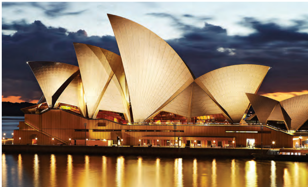
We tour Sydney's iconic Opera House on September 13.

World Heritage site that is the traditional land of the Anangu Aboriginal peoples and home to the Olgas rock formations and Uluru (Ayers Rock). We watch the sun set over this fabled sandstone monolith that rises to a height of 1,114 feet. B,D