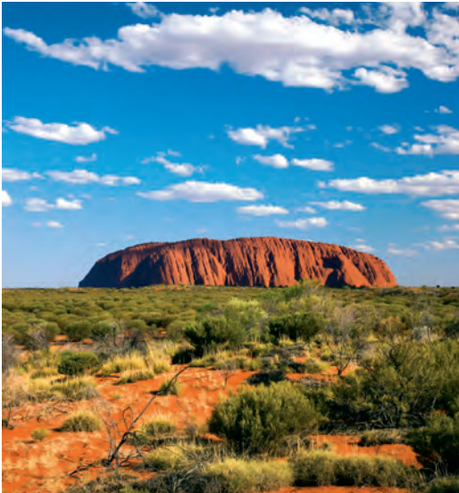
Aboriginal site of Uluru (Ayers Rock)

Friday, September 22: Auckland Our half-day tour of this city set atop 48 volcanic hills features glittering Auckland Harbour and the America’s Cup Village. We also visit the War Memorial Museum, with its prized Maori and Pacific Islander collections. Tonight we enjoy a farewell dinner at our hotel. B,D