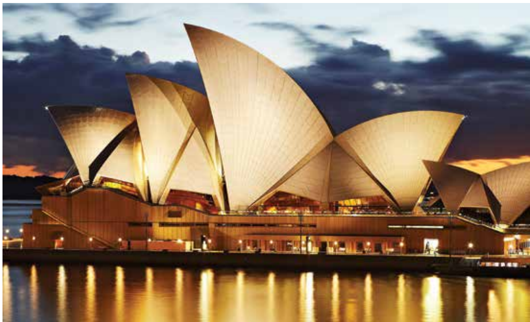
We tour Sydney's iconic Opera House on February 20.

World Heritage site that is the traditional land of the Anangu Aboriginal peoples and home to the Olgas rock formations and Uluru (Ayers Rock). We watch the sun set over this fabled sandstone monolith that rises to a height of 1,114 feet. B,D