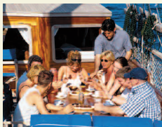
Indoor & outdoor public areas

Crew: 4 Avg. Length: 85 ft Passenger Capacity: 14 Avg. Width: 21 ft