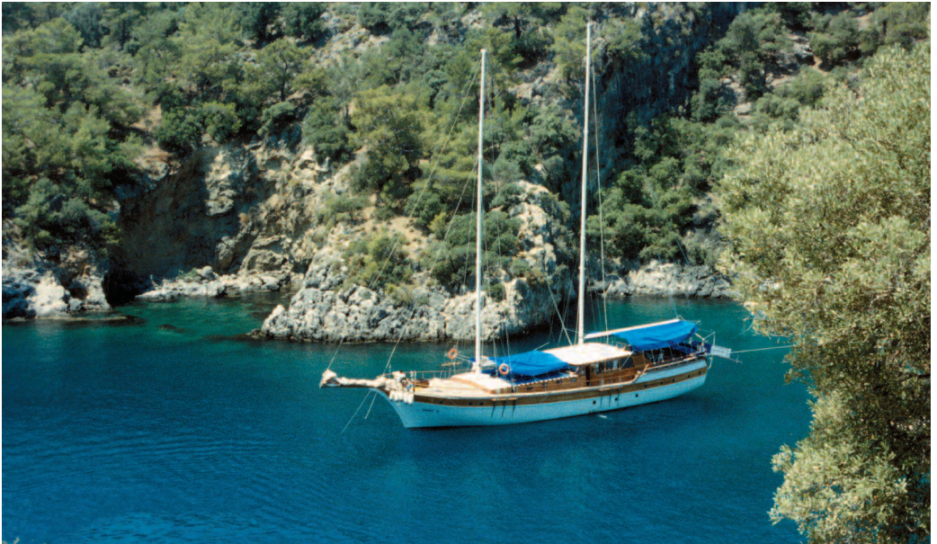
We spend four days aboard our privately chartered gulets on the stunning Turquoise coast.

the northern Aegean Coast for a brief visit to Gallipoli, haunting site of 31 Allied cemeteries from World War I. Then we ferry across the Dardanelles to Troy, once believed to exist only in Homer's epic poem until the present site was discovered in the 1870s. After touring here we continue south to Behramkale, ancient Assos, where we spend the night. B,L,D