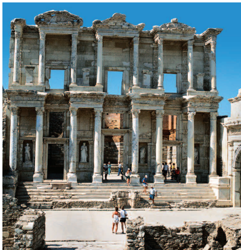
The spectacular ruins at Ephesus, which we visit on Day 7.

Day 15: Depart for U.S. We board early flights to return to the United States. B