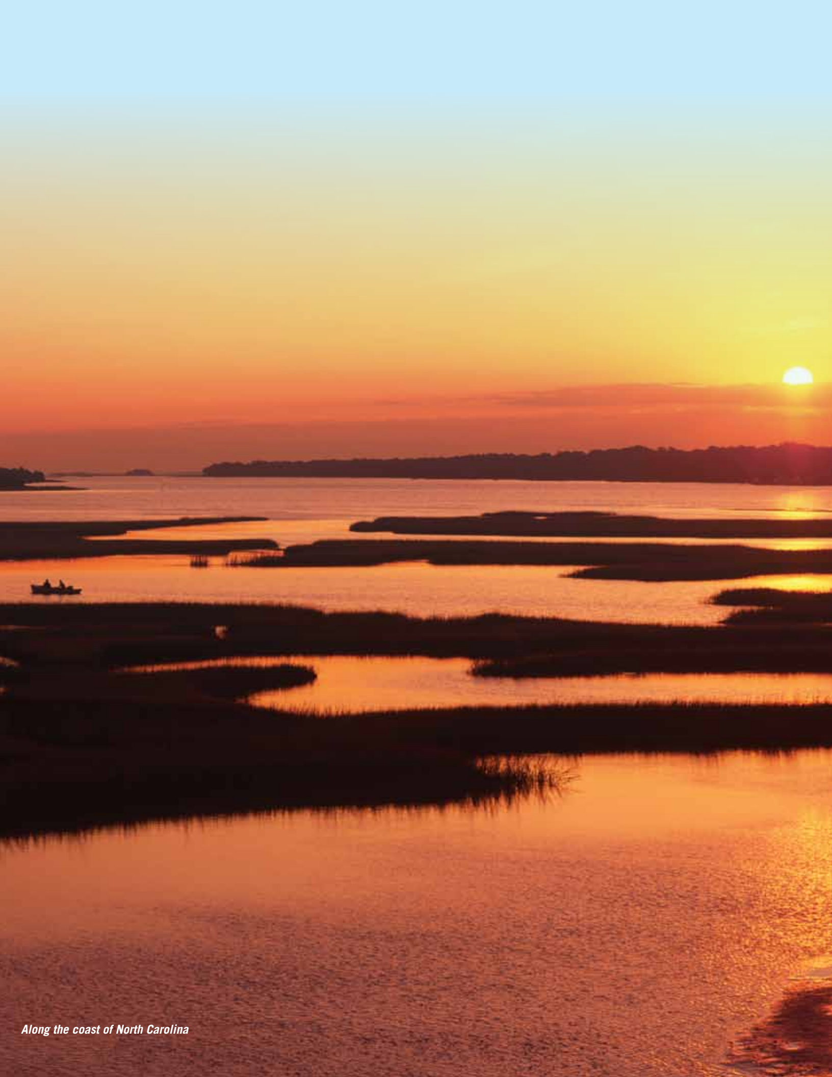
Along the coast of North Carolina