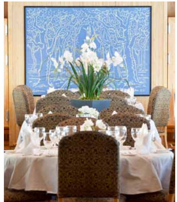
Yorktown's inviting Dining Room

Life aboard Yorktown is relaxed and informal, and dress is always casual. Guests discover soon after settling in that the ship's design fosters a sense of community and shared enterprise. Most cabins have large picture windows, and each is furnished with comfortable beds, a writing desk, ample storage, a clock/radio/CD player, and has a private bathroom. Your cabin is the perfect place for peace and quiet and for private rest and reflection. But you will want to spend most of your time in one of Yorktown's inviting common areas. The Lounge, never more than two decks away ( Yorktown has no elevator), is the hub of shipboard activity—the place to read, to converse with fellow travelers, to attend lectures and concerts, to enjoy a cocktail as the pianist performs on the ship's Steinway piano, or simply to enjoy unobstructed views of the passing scene. The Sun Deck affords similar opportunities to read and relax in the open air.