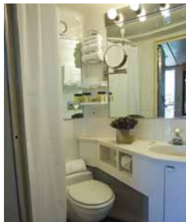
Cheerful bathrooms are appointed with fine toiletries