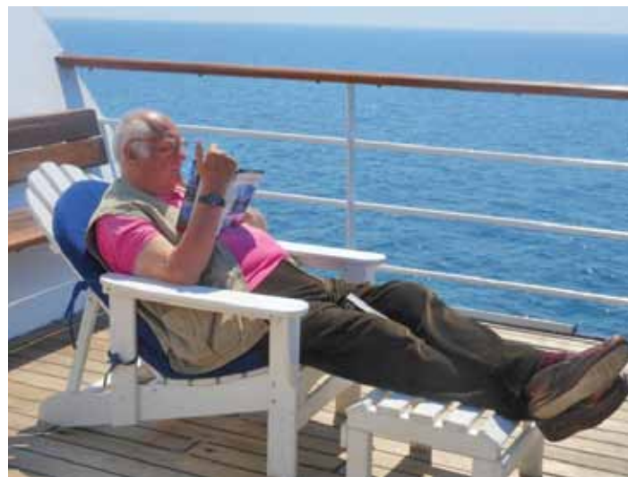
Relaxing on Yorktown's Sun Deck