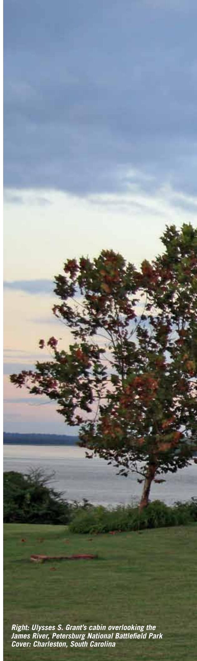
Right: Ulysses S. Grant's cabin overlooking the James River, Petersburg National Battlefield Park Cover: Charleston, South Carolina