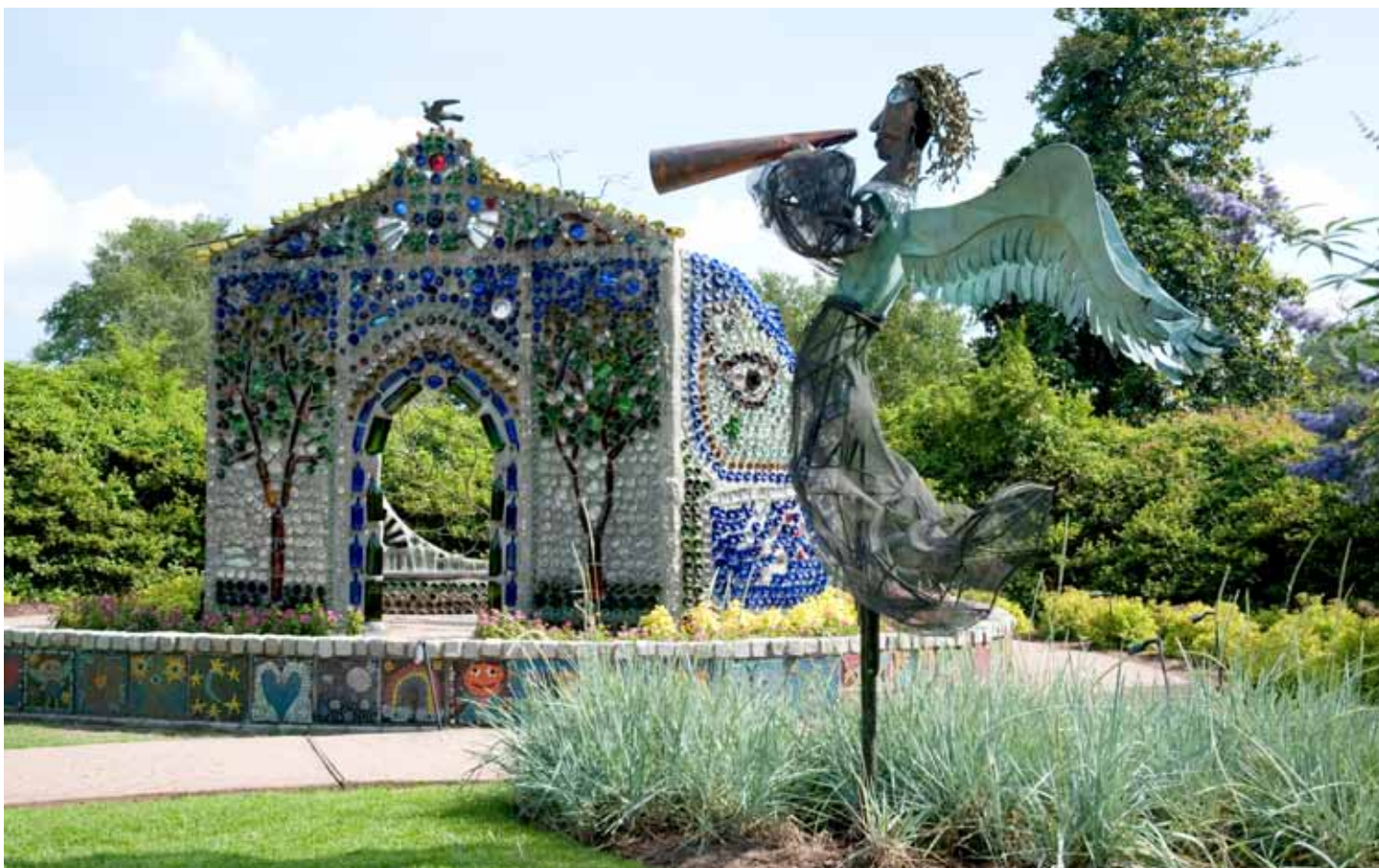
Airlie Gardens, Wilmington

In addition to the historical dimension of this voyage, there is also the unforgettable experience of sailing into some of the most beautiful harbors and waterways in America, including Charleston, Colonial Beach, and the Potomac and James Rivers. You'll find that the best way to explore the treasures of the South is by ship with a small group. Join us for the discovery of a lifetime.