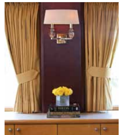
Details of the comfortable Lounge

For reservations or information, please call us at (415) 597-6720 [13]