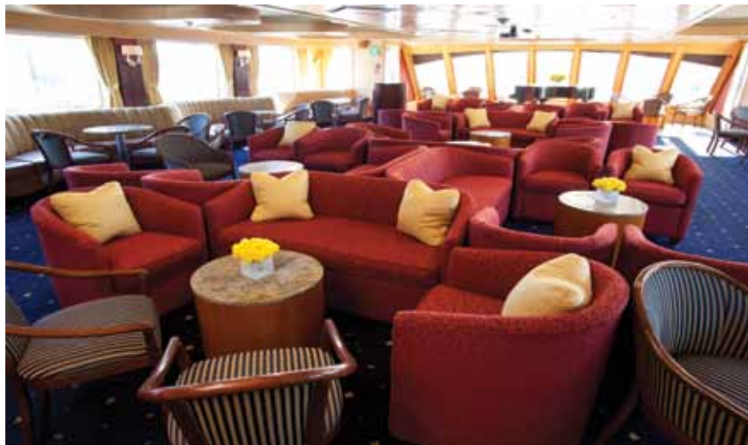
Yorktown's spacious Lounge is surrounded by windows