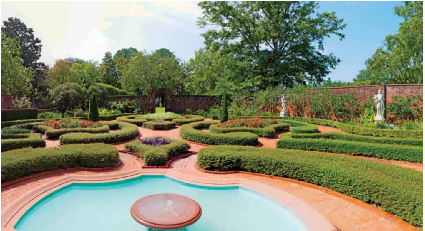
Tryon Palace gardens, New Bern