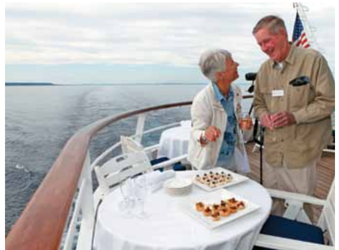
Enjoying an alfresco snack