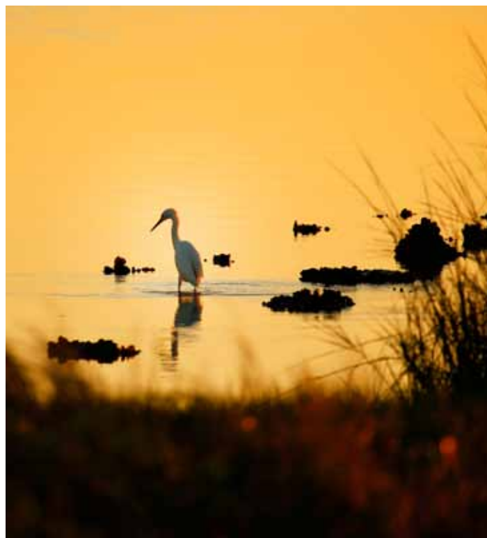
Sunset along the shores of Fredricksburg

Built in the mid-19 th century as the terminus of the North Carolina Railroad, Morehead City was home to large encampments by both armies during the Civil War. Visit The History Place, with its exhibits relating to the Civil War, as well as Fort Macon, a Confederate garrison. (B, L, D)