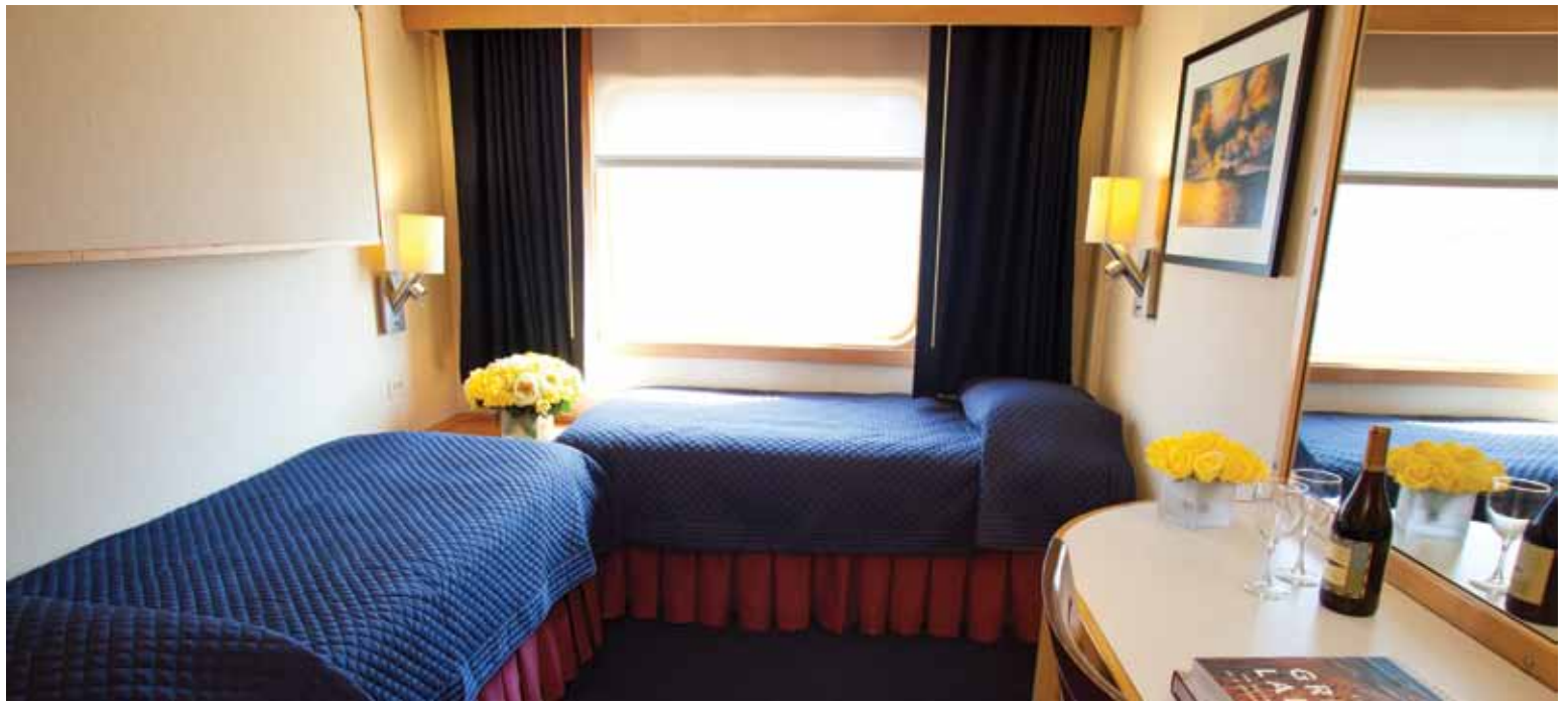
Most cabins feature a picture window