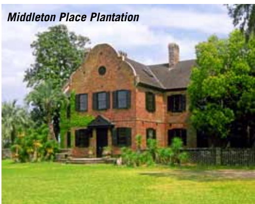
Middleton Place Plantation