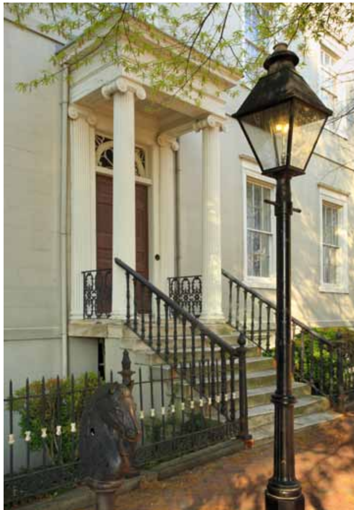
White House of the Confederacy, Richmond

Confederate. The Fredericksburg Historical District contains over 350 buildings dating from the 18 th and 19 th centuries and is on the National Register of Historic Places. Tour the Fredericksburg and Spotsylvania National Military Park, which preserves portions of four major Civil War battlefields. (B, L, D)