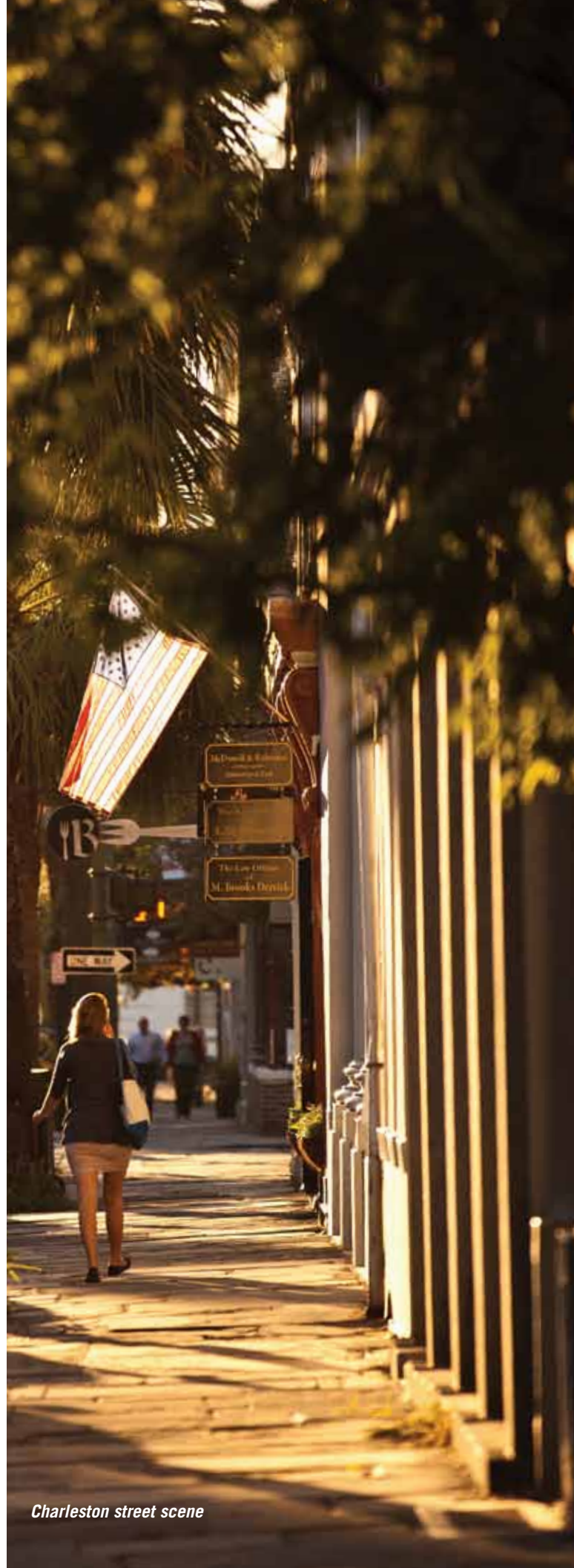
Charleston street scene

The Lowcountry stretches from Savannah to Pawleys Island in South Carolina. The emphasis in this cuisine is on seafood, especially crabs, shrimp, and oysters. Rice, grits, black-eyed peas, okra, and tomatoes are also staple ingredients. A Lowcountry classic, Frogmore stew is a one-pot meal consisting of shrimp, spicy sausage, and corn on the cob. Creamy she-crab soup is thought to have originated in Charleston, where it appears on almost every menu. The eggs of the female crab give the soup its wonderful flavor, and this is enhanced with a generous dollop of sherry. The Lowcountry also has its own variation on rice pilaf called perlaw, made of chicken, rice, celery, and onion. During this voyage, you will have the chance to sample some of these Lowcountry cuisine traditions.