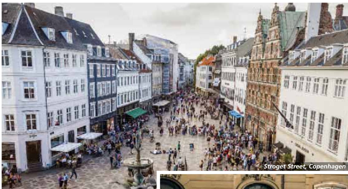
Stroget Street, Copenhagen