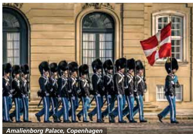
Amalienborg Palace, Copenhagen

Begin in Copenhagen, home to castles, canals and storybook charm. Sail through the Oslo Fjord to Norway's capital to explore Oslo's rich culture and Viking history. Venture through the country's impressive countryside via a renowned railway to Bergen, whose Old Town boasts a legendary waterfront, and witness the crystalline Sognefjord and quaint Flåm.