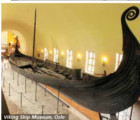
Viking Ship Museum, Oslo

peaceful parks and fascinating museums. Admire the Holmenkollen Ski Jump and visit its museum, which highlights the history and importance of skiing in Norway. Finally, stroll the grounds at Vigelandsparken, the city park famous for its sculptures by Gustav Vigeland.