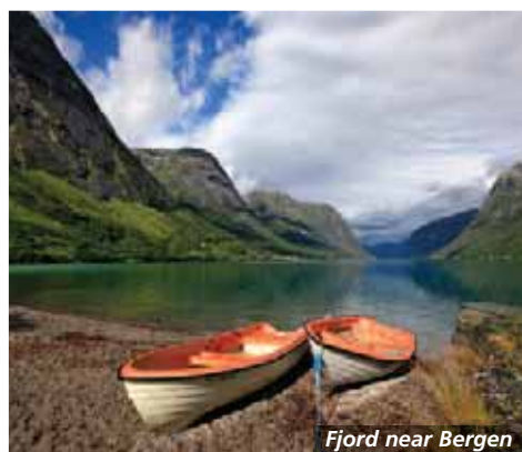
Fjord near Bergen

features mountains, forests, lakes and waterfalls, then return to Bergen via train.