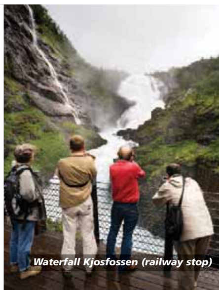
Waterfall Kjosfossen (railway stop)