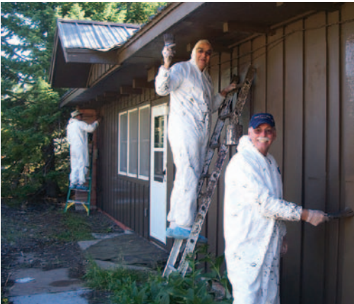
Help protect our national parks on a volunteer project

Tour ends: Rapid City, South Dakota. Fly home anytime; a transfer is included from Radisson Hotel Rapid City to Rapid City Regional Airport. Allow a minimum of two hours for flight check-in at the airport. Meals B