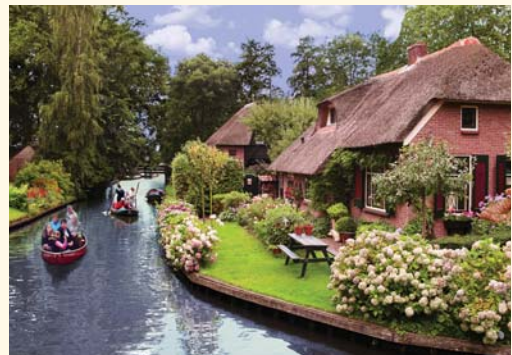
The quaint, picturesque town of Giethoorn boasts over four miles of canals and no traditional roads.

A private canal cruise offers a unique firsthand look at the integral role waterways have played for centuries in the life of this city. Amsterdam's canal district, a UNESCO World Heritage site ringed by concentric canals and lined with 16 th - and 17 th -century merchant row houses, charming houseboats, and world-renowned museums, is brimming with history and artistic wealth. What began as a simple fishing village developed into the thriving economic center of the world in the 17 th century and produced master artists including Rembrandt and Vincent van Gogh.