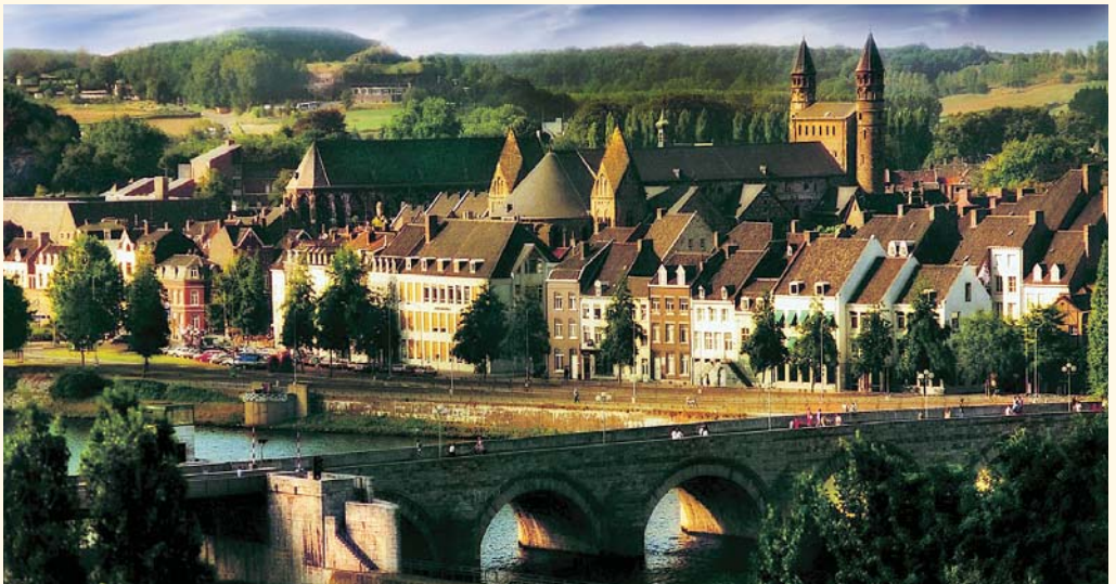
The River Meuse flows through ancient Maastricht, the southernmost city in The Netherlands, rich in history dating back to the Romans in the first century B.C.

The Old Town of Antwerp preserves its charming Flemish culture in its labyrinth