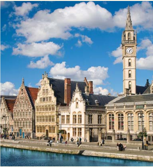
Ghent's medieval harbor, Graslei is known for its beautifully intricate, well-preserved guildhall façades.

of squares and narrow passages that lead into the spectacular Grote Markt, where beautifully preserved guildhalls once bustled with Antwerp's 16 th -century merchants and tradesmen. In the Cathedral of Our Lady, the pride of Belgium featuring a remarkable 47-bell carillon and soaring 401-foot, delicately ornamented spire, you will see the 17 th -century Baroque masterpieces of the city's native son, Peter Paul Rubens, including paintings of the Assumption of the Virgin Mary , The Raising of the Cross , and The Descent from the Cross .