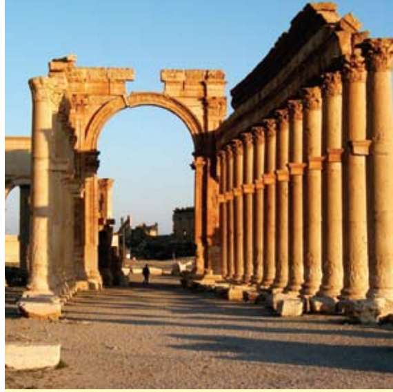
Fabled Palmyra, Syria

Disembark and transfer to the airport for return flights to the U.S. (B)