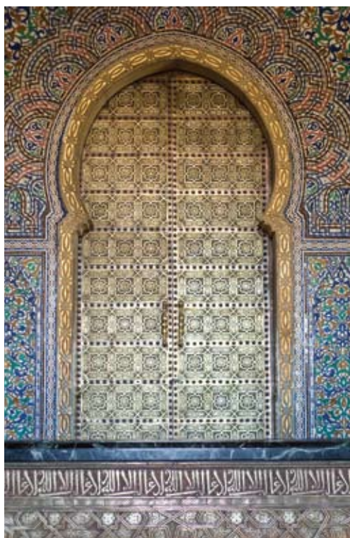
One of Rabat's characteristic doors

Granada exemplifies the best of Moorish culture, art, and architecture. Tour the Alhambra, a striking 13 th -century palace begun by the caliphs of the Nasrid dynasty, and stroll through the Generalife Gardens. There will also be an opportunity to see the Alhambra and Sierra Nevada mountains from above on an optional hot air balloon excursion ($325 per person). (B,L,D)