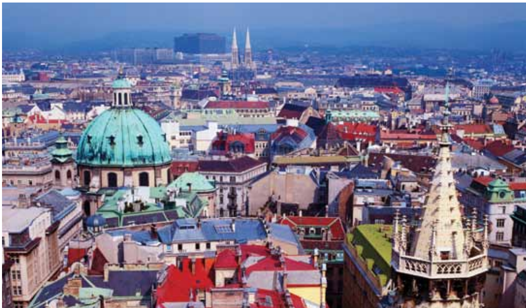
We enjoy both guided touring and free time in Vienna.

Chambers of Wawel Castle, seat of royalty for more than 500 years; and Wawel Cathedral, the national church. The remainder of the day is free to explore this charming city independently. B