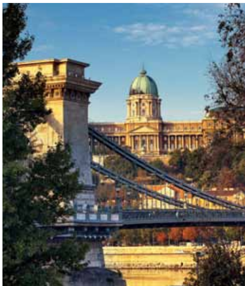
Budapest's Chain Bridge and Royal Palace.

Monday, October 21: Depart for U.S. We transfer to the airport early today for our connecting flights to the U.S. B