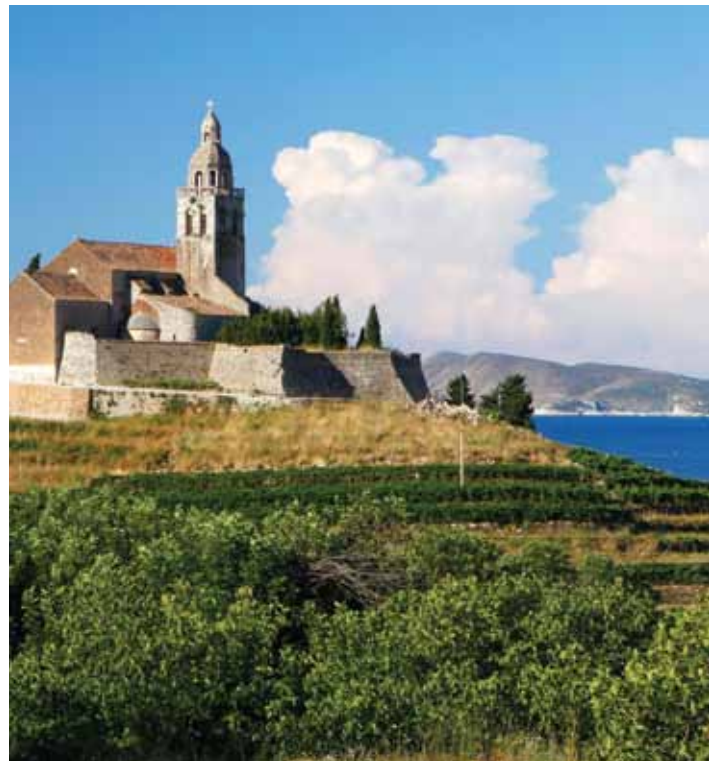
Komiza, Vis Island

A.D. 295-305. Today it is a designated UNESCO World Heritage site. An extensive structure, much of which is well preserved, the palace contains within its walls Split's medieval town, making it the only palace that has been continuously inhabited since Roman times. Our tour includes a visit to its underground cellars, the Mausoleum, Jupiter's Temple, the Peristyle, and the Northern Gate. Conclude the city tour with a visit to the gallery of famous Croatian sculptor, Ivan Mestrovic. (B, L, D)