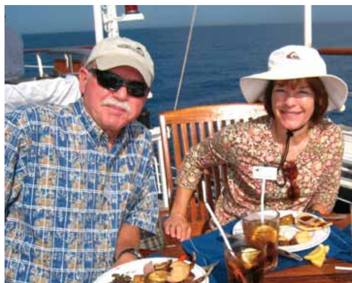
Dining on deck

All of Corinthian's suites face outside, providing views of the sea and landscape. Several have a private balcony. There are expansive open deck areas and attractive facilities, including a gym, spa, library (with Internet access), beauty salon, two lounges, a sun deck with Jacuzzi, and an outdoor cafe. An elegant restaurant accommodates all guests in an open, unassigned seating. An elevator serves all decks. A resident physician attends a well-equipped infirmary. Wi-Fi is available throughout the ship.