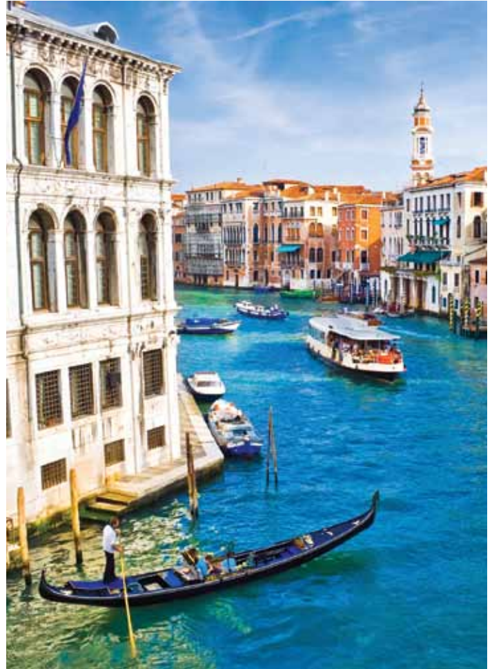
Venice's Grand Canal