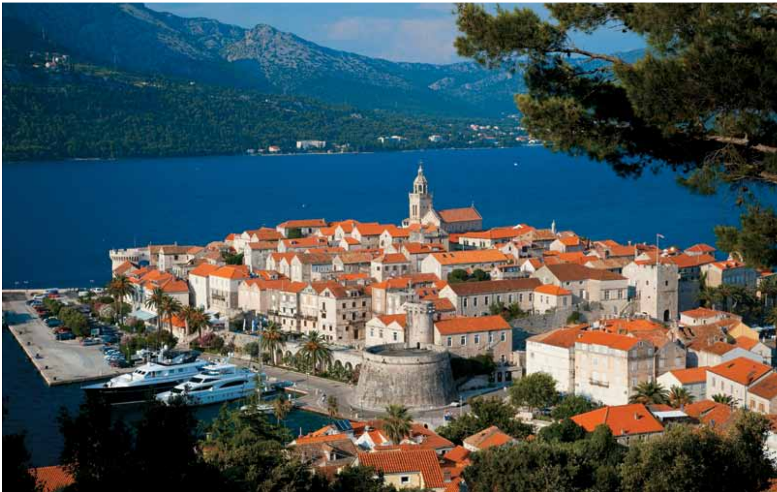
Korcula's perfectly preserved medieval town

F ROM THE DECK OF YOUR ELEGANT SHIP, ISLANDS APPEAR—evolving forms held in bright sunshine above impossibly clear, royal blue seas. As the ship rounds bleached cliffs, forest mounds, and pebble beaches, a port comes into view: a medieval walled town, perched like a captain on the prow of his ship, virtually unchanged through six centuries or more. Its crenellated walls, campaniles, and patrician villas speak of a rich past. At night, moonlight pools on the ancient flagstones.