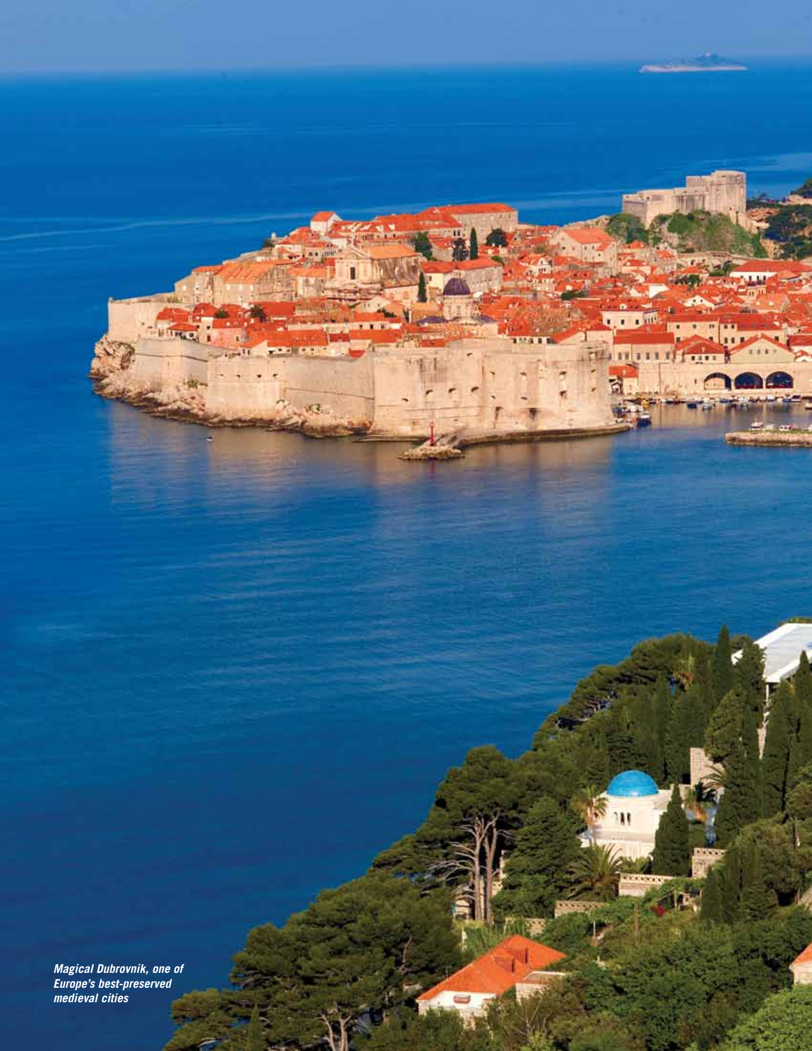
Magical Dubrovnik, one of Europe's best-preserved medieval cities