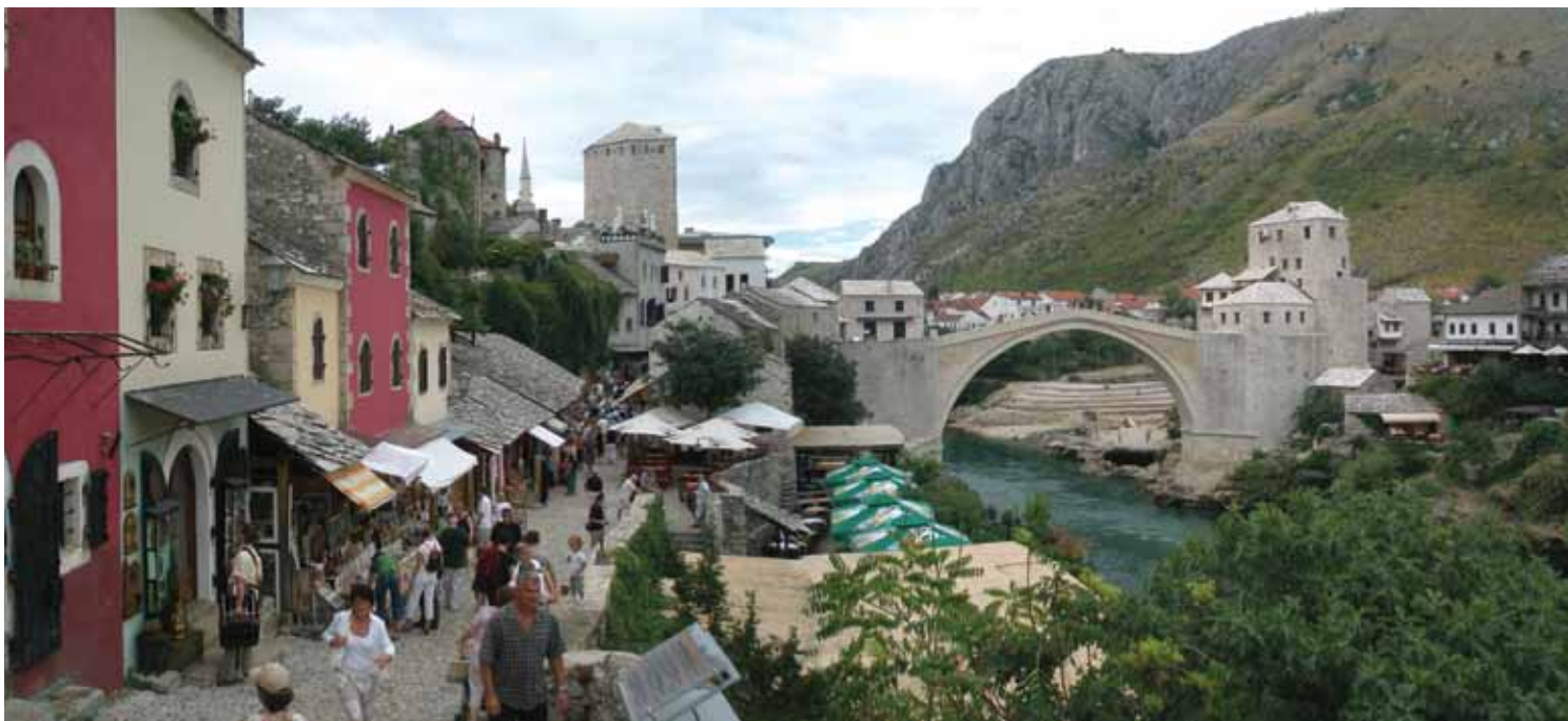
Mostar, with its landmark bridge, built originally in 1566, spans the emerald Neretva River

Disembark and transfer to the airport for return flights. (B)