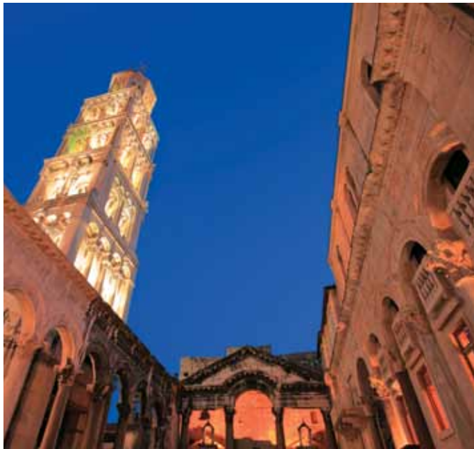
Split's old town, built within Roman Emperor Diocletian's Palace

Originally a Greco-Illyrian settlement, Split is an ancient city centered around the formidable Palace of Diocletian, built in