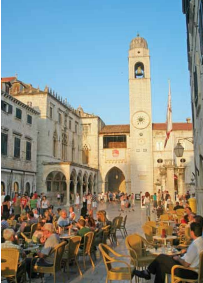
In the Old Town of Dubrovnik