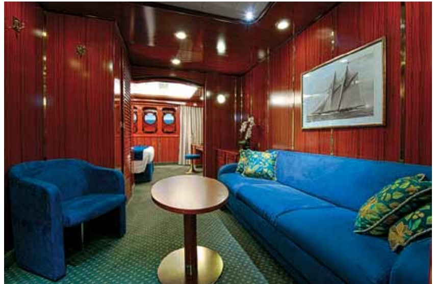
Category C Suite