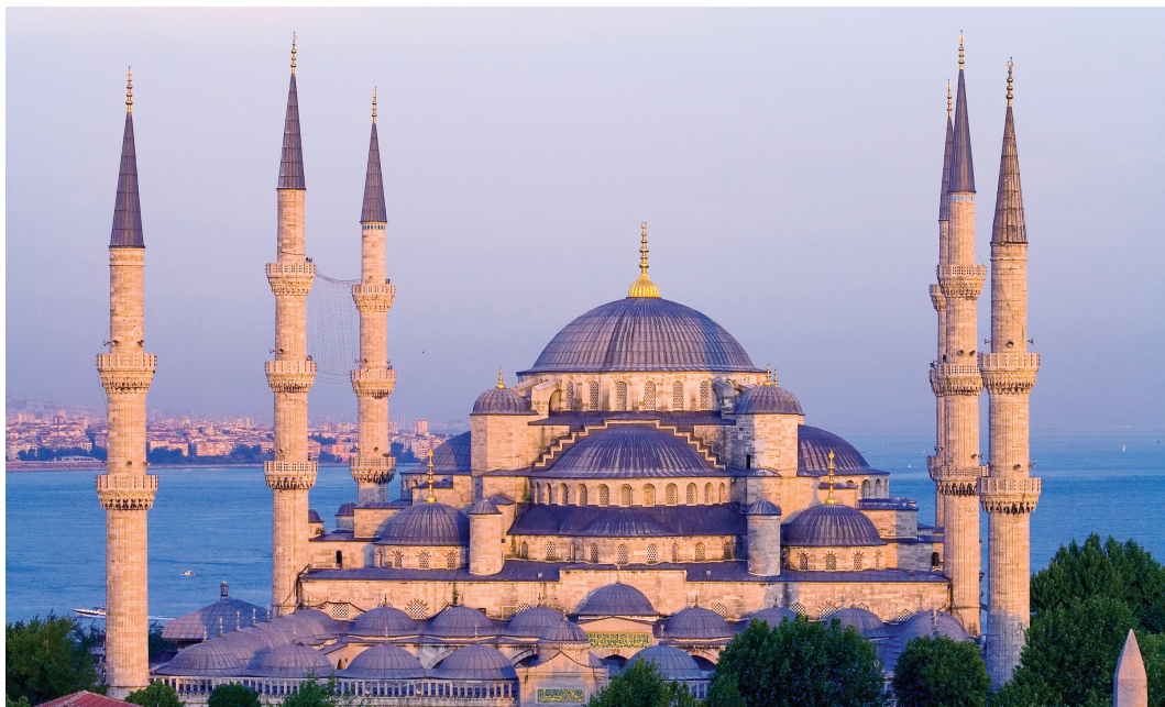
Istanbul's Blue Mosque combines Ottoman and Byzantine design.

sultans that today ranks among the world's richest museums. Continue on to the Basilica Cistern, the marble-columned underground chamber that provided water to Istanbul in antiquity, and the Grand Bazaar, housing some 5,000 shops along 60 "streets." B