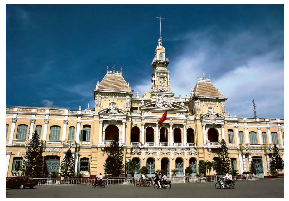
Observe the French architectural influences during an orientation tour of Hanoi on Day 3.

charming car-free pedestrian zone lined with tailors, shops, and art galleries. This afternoon is at leisure to either remain in Hoi An on your own or return to our beachside resort for a relaxing interlude. B