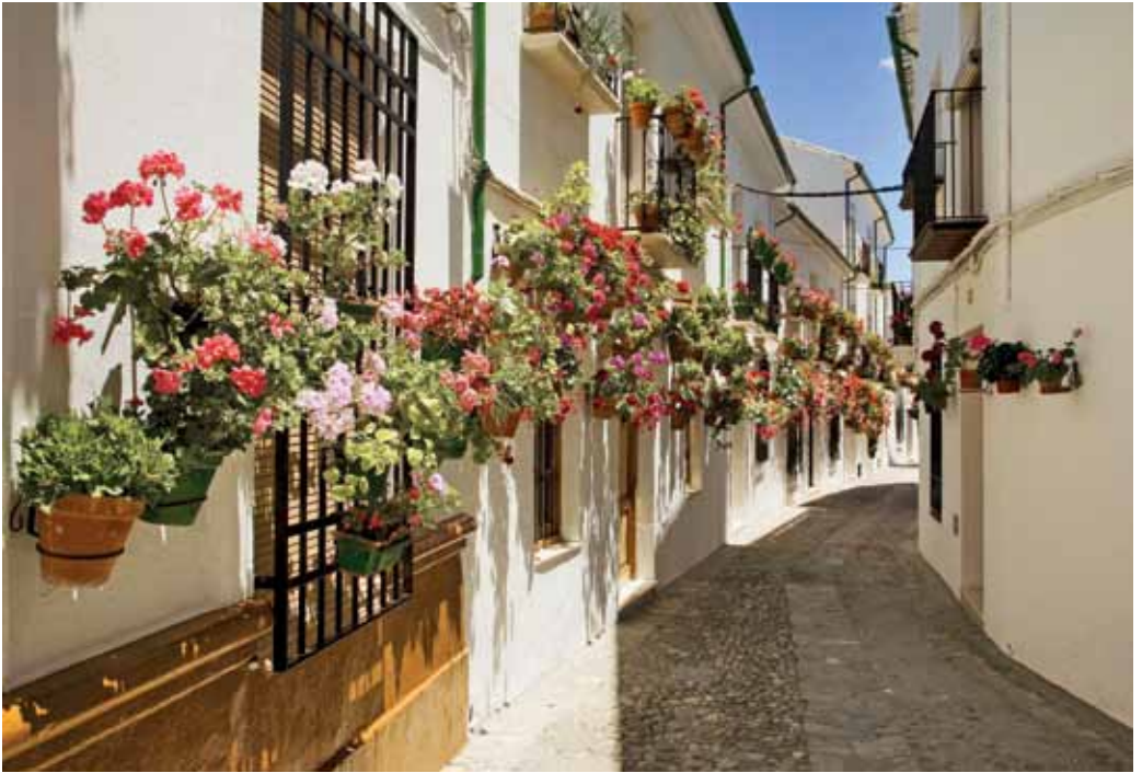
Flower-bedecked Cordoba street