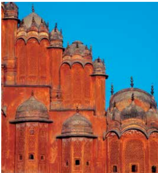
Jaipur's beautiful Palace of the Winds.

Then we return to our hotel with time to rest before this afternoon's walking tour. Tonight we celebrate our journey at a farewell dinner at our hotel. B,D