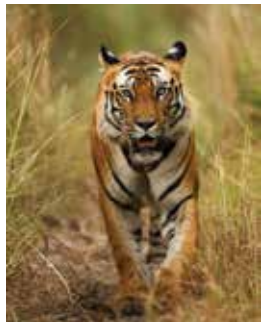
We may see Bengal tigers at Ranthambore.

Friday, November 18: Agra/Varanasi We depart by coach this morning for Delhi, where we board a late afternoon flight to Varanasi, the holiest city in Hinduism. We dine tonight at our hotel. B,L,D