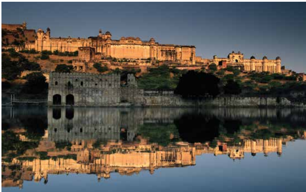
We visit Amber Fort, a UNESCO World Heritage site, on November 9.