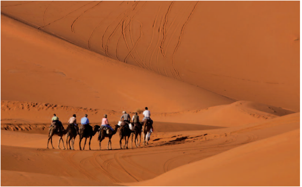
We enjoy a sunset Sahara excursion on May 5.

educational, and religious institutions. Begin with a walking tour of Fez’s fascinating medina , a UNESCO World Heritage site, focusing on the artisans’ quarters, the 14 th -century Koranic schools, and Al Karaouine, the medieval theological university. Return to the hotel for lunch and some time at leisure then mid-afternoon tour the old mellah (Jewish quarter) and its 17 th -century synagogue, the royal gates, and the Museum of Fez. Tonight enjoy a private dinner in a traditional family home. B,L,D