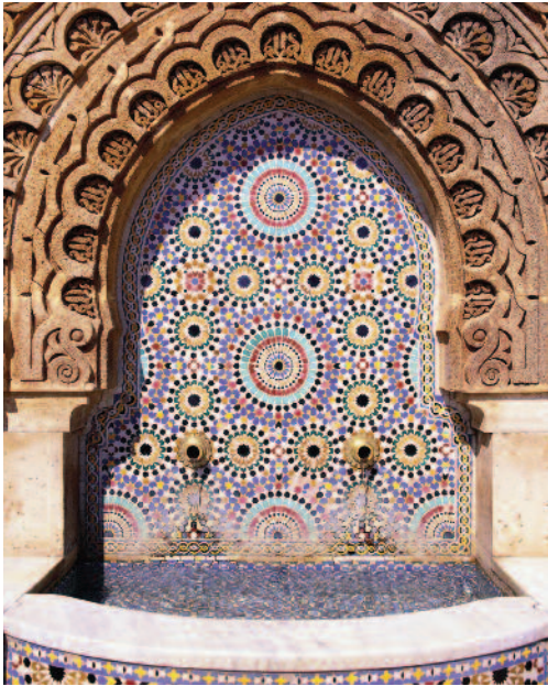
Tiled fountain detail, Rabat

Friday, May 11: Depart for U.S. After breakfast this morning transfer to the airport for your return flight to the United States. B