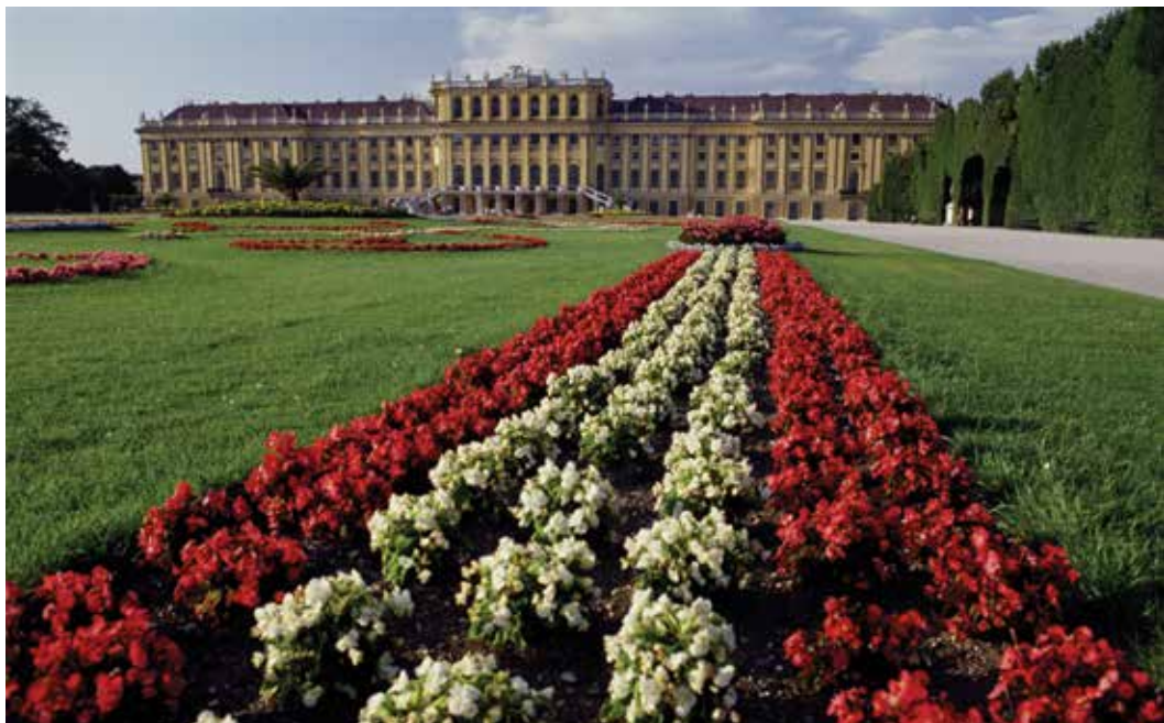
Explore Vienna's majestic Schönbrunn Palace.

Chambers of Wawel Castle, seat of royalty for more than 500 years; and Wawel Cathedral, the national church. After the tour, if schedules permit, a briefing will take place at the U.S. Consulate. The remainder of the day is free to explore this charming city independently. B