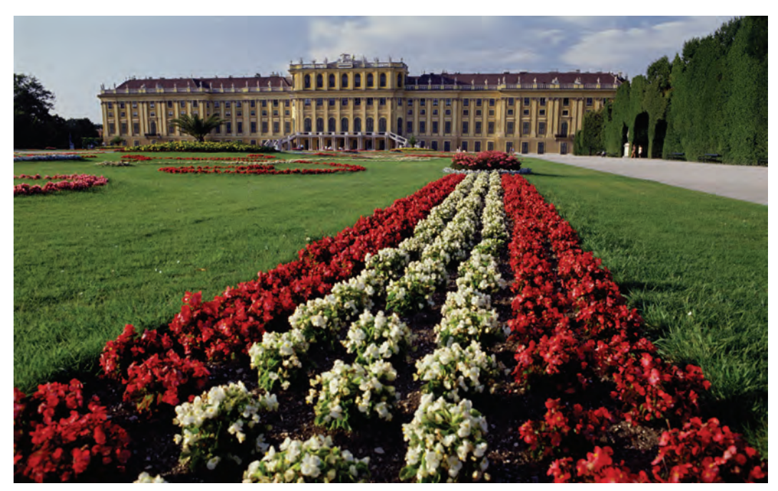
Explore Vienna's majestic Schönbrunn Palace.

Chambers of Wawel Castle, seat of royalty for more than 500 years; and Wawel Cathedral, the national church. After the tour, if schedules permit, a briefing will take place at the U.S. Embassy. The remainder of the day is free to explore this charming city independently. B