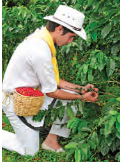
We visit a coffee plantation on November 13.

Today we visit nearby Santa Elena, a typical – and beautiful – colonial town where traditions related to Colombia’s flower-growing prowess live on. After touring here, we enjoy lunch with a local family. Next we board the Medellín Metrocable, the city’s iconic gondola that traverses a 1.2-mile route to the Santa Domingo barrio to Biblioteca España, Medellín’s treasured ultra-modern library complex. Then we descend by Metrocable to the city center. We return to our hotel late afternoon; dinner tonight is on our own. B,L