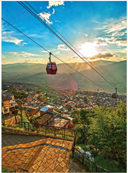
We ride the Medellín Metrocable over the city.

buildings bedecked with flowers, and intimate plazas. Then the remainder of the day is at leisure for independent exploration. Lunch today is on our own in this vibrant seaside city; tonight we take a traditional horse-drawn carriage ride to our farewell dinner at a local restaurant. B,D