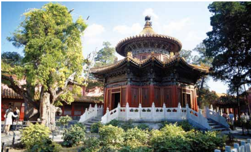
Tour the historic Forbidden City complex on Day 3.

greatest cities that devolved into a provincial backwater until the accidental discovery of the Terra Cotta Warriors in 1974 — considered among the most significant archaeological finds of the 20 th -century. This afternoon, we tour Xian’s impressive nine-mile city wall and moat. Tonight, we enjoy a special dinner of traditional Chinese dumplings. B,L,D