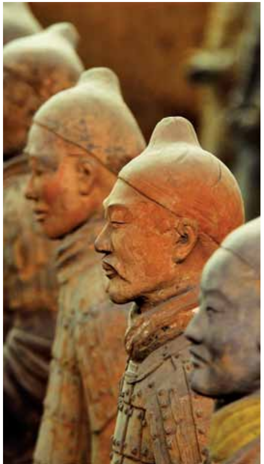
We view Xian’s amazing Terra Cotta Warriors on Day 7.

Monday, September 21: Depart for U.S. We depart Shanghai for our return flights to the U.S. B