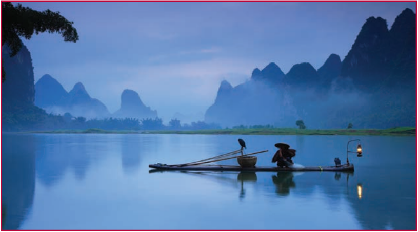
Comorant Fisherman, Guilin