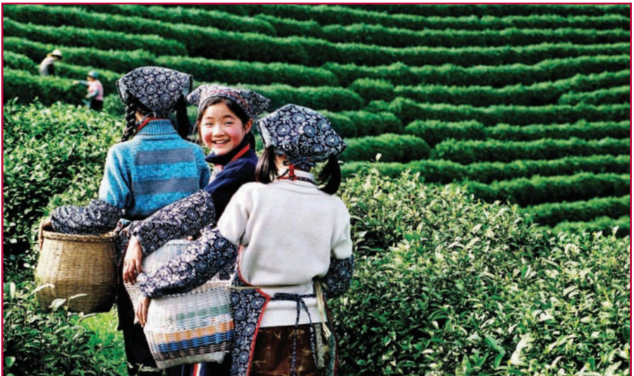
Tea Cultivation, Hangzhou

Prices are subject to change without notice.