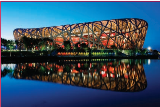
Bird's Nest, Beijing