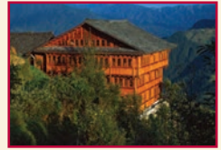
Li An Lodge