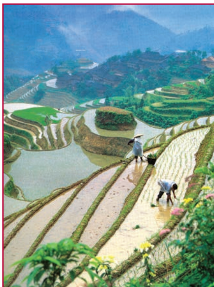
Longsheng Rice Terraces

After breakfast, stroll through Huangang