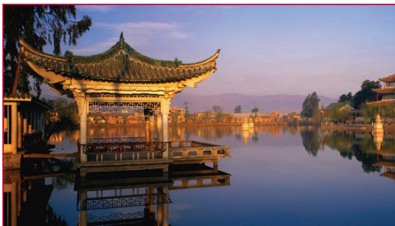
West Lake, Hangzhou

Park with its lovely flora and fauna, so representative of southern Chinese elegance.