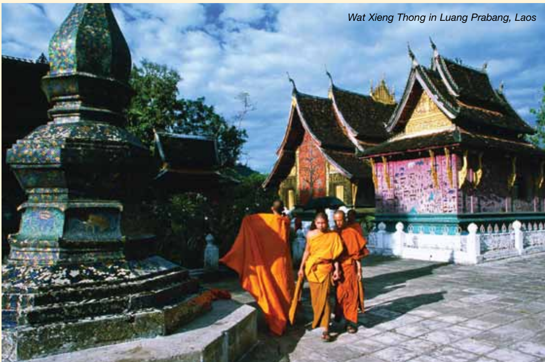
Wat Xieng Thong in Luang Prabang, Laos

For reservations or information, please call us at (415) 597-6720, or email travel@commonwealthclub.org