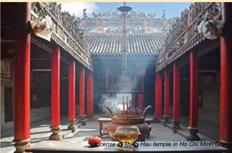
Incense at Thien Hau temple in Ho Chi Minh City