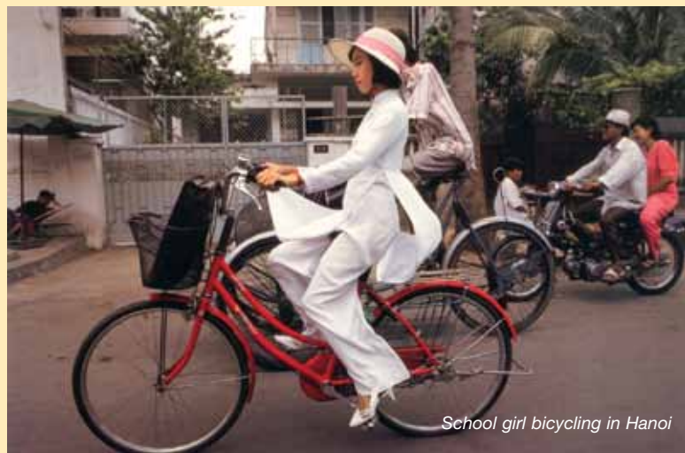
School girl bicycling in Hanoi