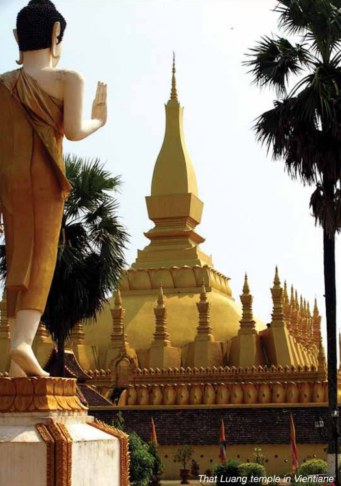
That Luang temple in Vientiane

broad tree-lined boulevards, and beautiful lakes. Enjoy a cyclo (bicycle rickshaw) tour of Hanoi's Old Quarter, a colorful maze of alleys where commercial life thrives. Gather this evening for a welcome dinner. SOFITEL METROPOLE HANOI (D)