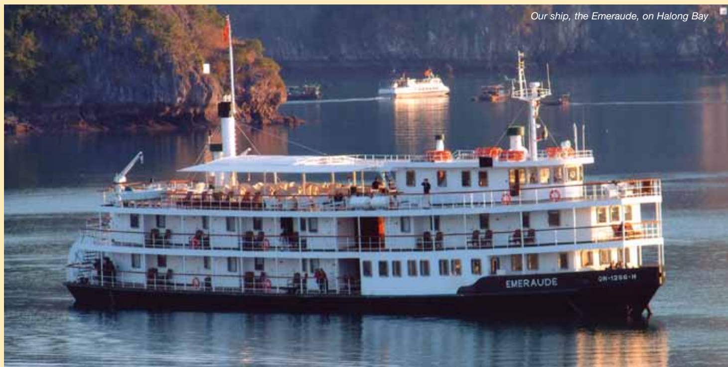
Our ship, the Emeraude, on Halong Bay

Thursday, November 11 Enjoy a walking tour of the ancient town center, taking in the 400-year-old Covered Bridge, the colorful open market, and the wonderful