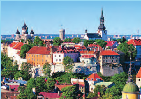
Stroll through Tallinn, a hub of European culture and commerce that retains its history in the 600-year-old spires and gables of its skyline.

Peter the Great founded the majestic city of St. Petersburg in 1703 as his “Window on the West.” This afternoon, see one of the world’s greatest art repositories on the tour of the incomparable State Hermitage Museum, former