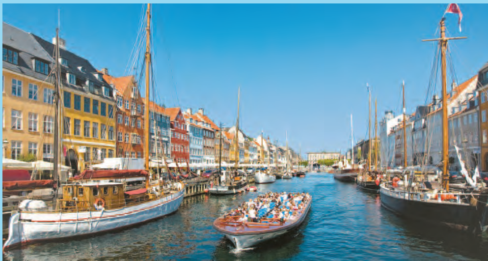
The Vikings’ legacy and the maritime character of a traditional Hanseatic city are showcased along Copenhagen’s Nyhavn Waterfront.

Enjoy exploring the city’s legendary landmarks, which are scattered across more than 100 islands linked by six times as many bridges. St. Petersburg’s main thoroughfare, Nevsky Prospect, showcases exquisite examples of Russian Baroque and neoclassical architecture. On the morning tour, see the beautiful Church of Our Savior on Spilled Blood (Church of the Resurrection of Christ), built on the site of Emperor Alexander II’s assassination, and the 19th-century St. Isaac’s Cathedral, with a striking golden dome that is one of the glories of the city’s skyline. Visit St. Petersburg’s first building, the Peter and Paul Fortress, constructed to secure the country’s access to the sea. See the impressive Baroque Cathedral of Sts. Peter and Paul, containing the tombs of 32 czars, from Peter the Great to Nicholas II, the last of the Romanovs.