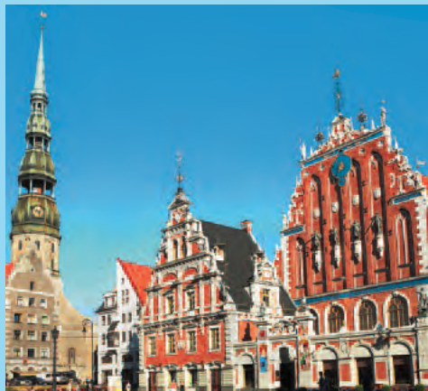
To commemorate Riga’s 800th anniversary in 2001, the town’s citizens donated bricks to rebuild the magnificent 14th-century Blackheads House.

The afternoon is at leisure. Alternatively, join the optional excursion to the imperial compound of Pushkin and Catherine the Great’s elaborate rococo palace, highlighted by a special visit to the extraordinary Amber Room.