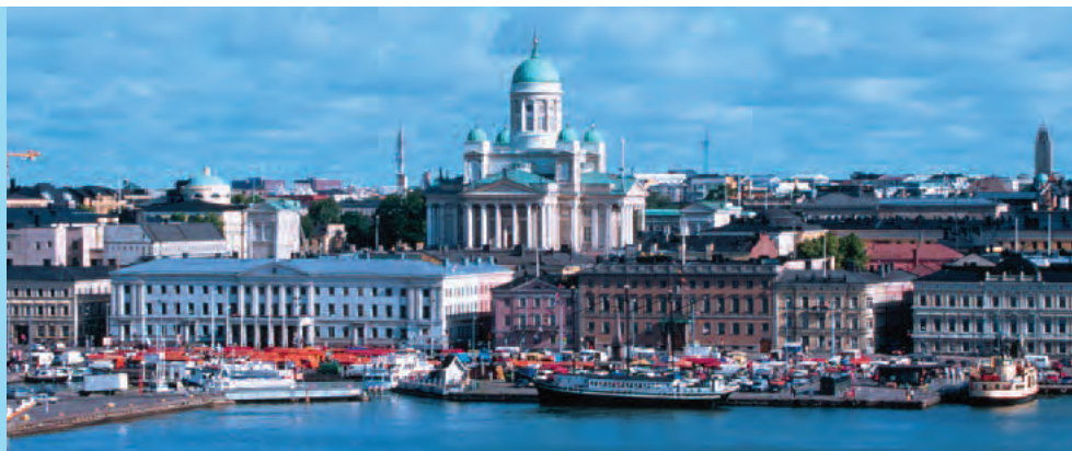
Admire the neoclassical and contemporary architecture of Helsinki, Finland, the “White City of the North.”