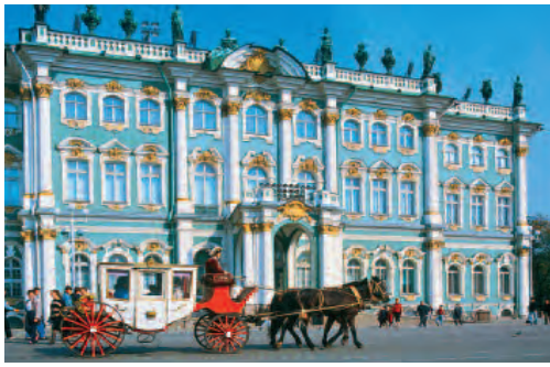
Tour the renowned State Hermitage Museum, once home to Catherine the Great, now the repository of Russia's greatest art collection.