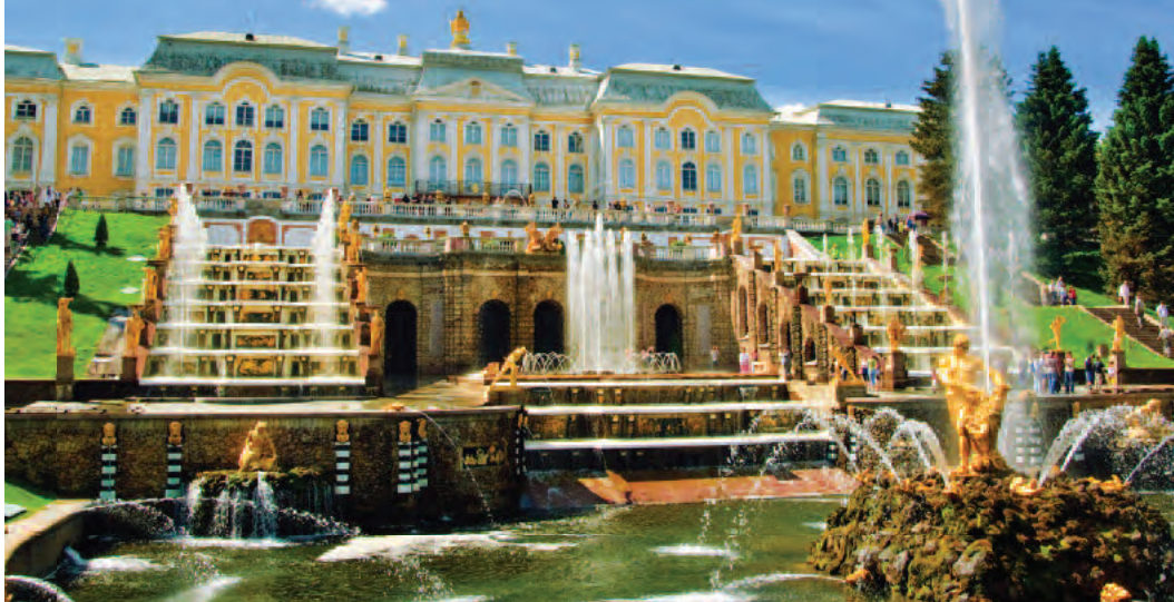
Photo this page: The focal point of Petrodvorets, Peter the Great's summer palace, is the magnificent Grand Cascade, the waters of which start at the Great Palace and flow down to the Gulf of Finland.

Cover photo: In Stockholm's most historic district, the Gamla Stan, stately 17th-century palaces and cathedrals are interspersed with narrow alleys and pedestrian walkways lined with charming bookstores, antique shops, cafés and restaurants.