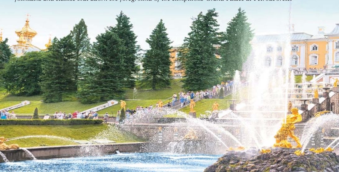
Photo this page: Peter the Great himself partially engineered the resplendent plexus of waterfalls, fountains and statues that adorn the foreground of the sumptuous Grand Palace at Petrodvorets.

Cover photo: Spanning 14 small islands where shimmering Lake Mälaren meets one of the largest archipelagos in the Baltic Sea, Stockholm balances medieval and Renaissance architecture with modern urban design.