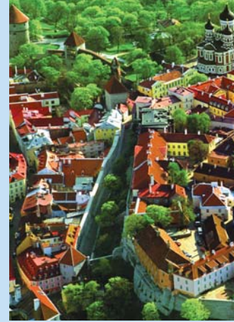
Tallinn, a hub of culture and comthe 600-year-old spires and gables

After cruising into the heart of the city, enjoy a specially arranged, early-entry guided tour of one of the world's greatest art repositories, the incomparable State Hermitage Museum. Former czarist palace of Catherine the Great and a UNESCO World Heritage site, its spectacular collections are rivaled only by the museum's lavish interior.