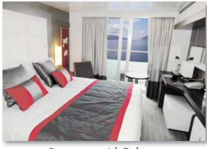
Stateroom with Balcony

In keeping with the low passenger density, the public areas are spacious and inviting and can accommodate all passengers comfortably. Enjoy views from the Panoramic Lounge, nightly entertainment in the Main Lounge, and lectures, cultural performances and film screenings in the state-of-the-art theater. There is a library, Internet salon, Sun Deck, swimming pool, beauty salon, spa, Turkish bath-style steam room, full range of fitness equipment and two elevators. The infirmary is staffed with a doctor and nurse. The highly trained and personable, English-speaking, international crew provides attentive service.