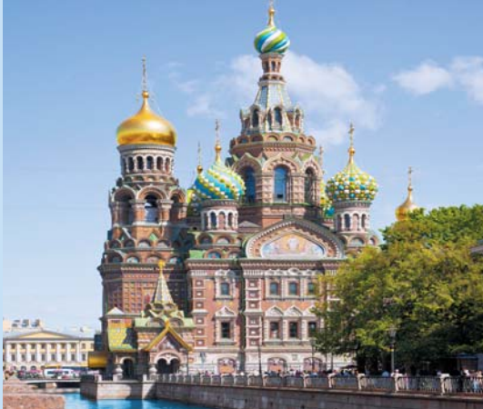
St. Petersburg's Church of the Resurrection of Christ is a showcase of neo-medieval Russian architecture.

Enjoy time at leisure before returning to the ship. This evening, attend the Captain's Farewell Reception. (B,L,R,D)