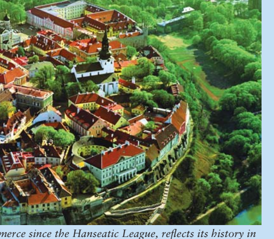
that define its picturesque skyline.

On a panoramic city tour, see the stately Senate Square and the diplomatic quarter of Kaivopuisto. Visit the modernistic Temppeliaukio Church, or "Church of the Rock," impressively hewn out of natural bedrock. Enjoy free time to explore Helsinki's lively Market Square before reboarding the ship. (B,L,D)