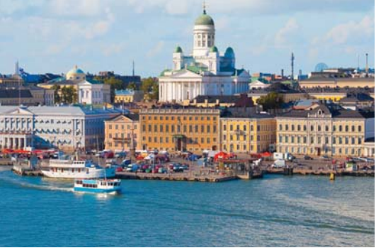
Finland's waterfront capital city of Helsinki showcases elegant Jugendstil architecture along its picturesque harbor.