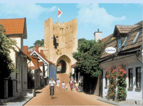
Visby's medieval wall, constructed in the 13<sup>th</sup> century, stretches two miles in length around the town.

Having largely escaped the ravages of World War II, Tallinn's UNESCO World Heritage-designated Old Town has remained virtually unchanged for 600 years. During the walking tour, see Toompea Castle—the seat of