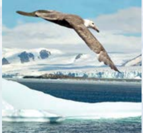
The southern giant petrel spends most of its life at sea, yet often returns to the same nest annually.

Buenos Aires, birthplace of the tango, is a city of diverse and dynamic barrios (neighborhoods). See the colorful La Boca district, Monserrat's grand public