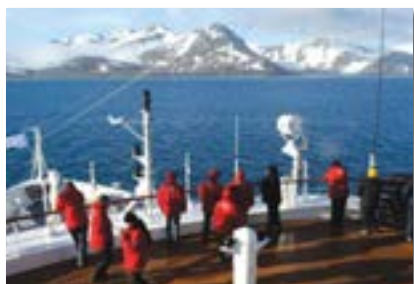
Forward Observation Deck