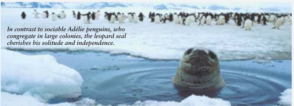
In contrast to sociable Adélie penguins, who congregate in large colonies, the leopard seal cherishes his solitude and independence.

Listen for the low rumbling of Rudolf Glacier as it calves chunks of ice into Neko Harbor , named for an early 20 th -century whaling boat. The harbor is surrounded by soaring glaciers and snow-covered mountains and is one of the most dramatic and spectacular sights in Antarctica. Here, make your first "continental landing" in Antarctica.