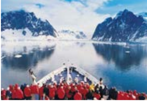
Stand on the bow of the M.S. LE BORÉAL and watch Antarctica's drama unfold before you.