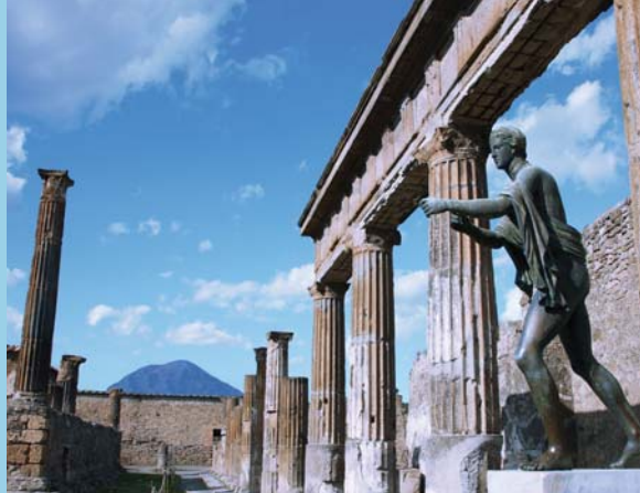
Found in fragments in 1817, this statue of Apollo was one of the first bronzes to be excavated at Pompeii.

An outpost of the ancient Roman Republic, today Sorrento is one of the most scenic towns in Italy and is the gateway to Mt. Vesuvius and the ancient ruins of Pompeii. This quaint seaside town features dramatic cliffs dotted with brightly hued buildings and abundant