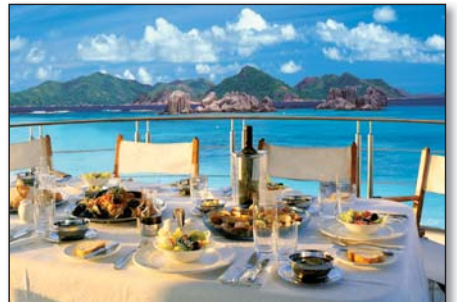
Alfresco dining on the Sun Deck