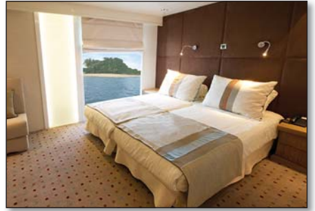
Category 1 Cabin

The English-speaking European crew provides courteous, professional service. The ship is fitted with state-of-the-art twin stabilizers and is meticulously maintained. It complies with the highest safety standards. The ship is equipped with two Zodiacs for shore transport in some small ports.