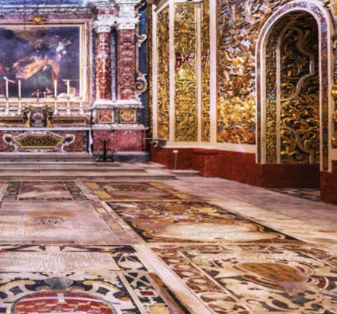
St. John's Co-Cathedral in Valletta depicts scenes

Visit the magnificent Greek Theater where Aeschylus once spoke to ancient Syracusans. Inside the Baroque cathedral, built on the ruins of a fifth-century B.C. temple to Athena, admire the unique baptismal font, an ancient marble krater (large vase) resting on 13 th -century bronze lions.