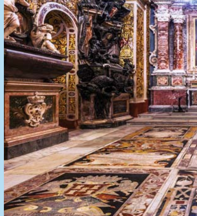
The ornate Baroque interior of 16 th -century from the apostle's life.