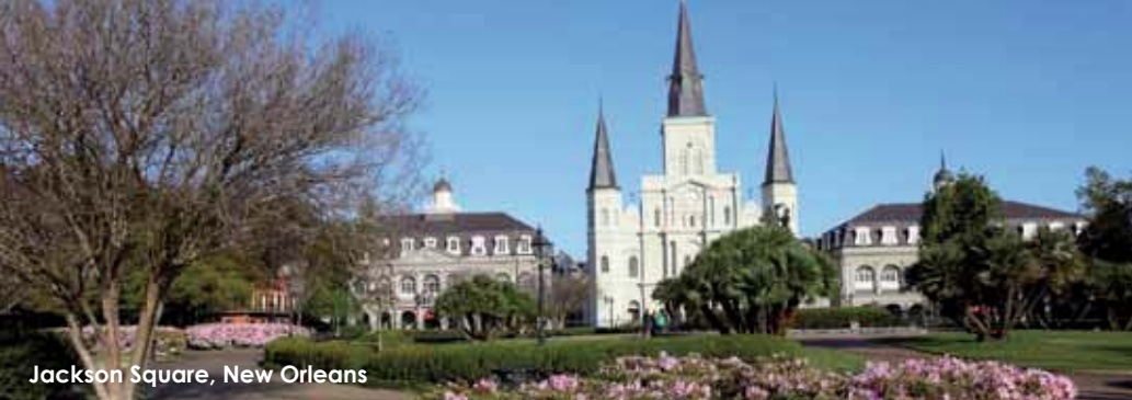
Jackson Square, New Orleans