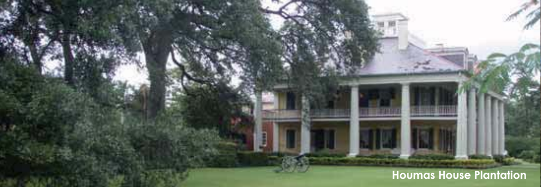
Houmas House Plantation